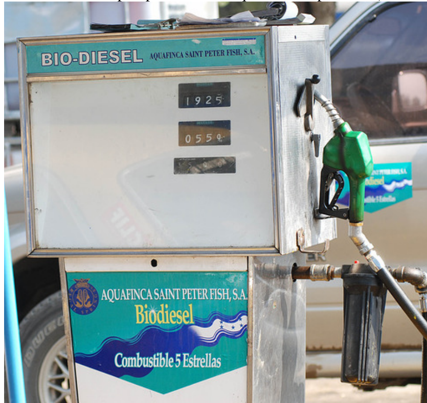
Photo 1: Biofuel pump outside the aquafinca tilapia farm (Honduras)